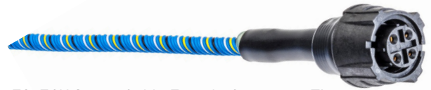
FG-ECX Sense Cable Female Connector Tip

2 Communication Wires and 2 Wires for Locating