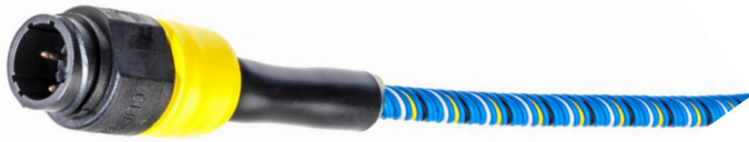
FG-ECX Sense Cable Male Connector Tip